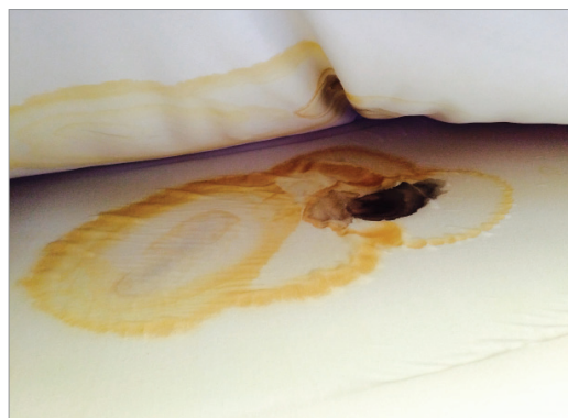
Figure 2. An example of a mattress with strikerthrough.

the size and scope of the problem that it came to the attention of senior procurement and clinical managers (Stewart, 2010). In response, UK industry produced and promoted a guide for the care, cleaning and inspection of healthcare mattresses (BHTA, 2011). The aims of this report were supported by equipment manufacturers.